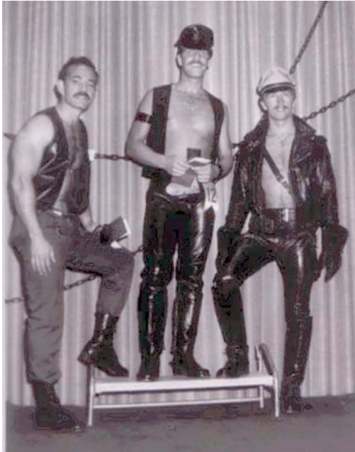
IML’s first winners, 1979